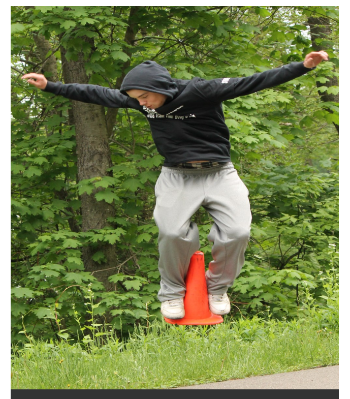
Community Voices caught Volunteer Jumping for Joy at the 4th Annual 5K Run and Walk for Mental Health in Franklin