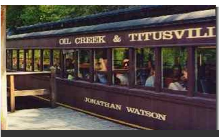
Community Voices and the Journey Towards Recovery moves forward in Venango County

Community Voices C/FST conducts confidential, voluntary, face-to-face interviews with Venango County residents and families who receive mental health and/or drug and alcohol services and supports. C/FST information is shared with local providers, Value Behavioral Health, Venango County Mental Health and Substance Abuse Administration. Community Voices is sponsored by Community Services of Venango County.